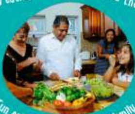
Fun activities for the whole family