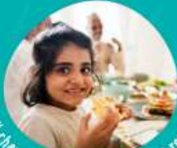
Small changes that make a big difference