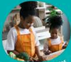
Healthy eating tips