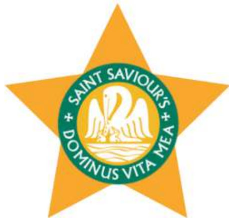
Saturday School Elnathan