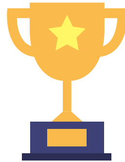
KS2 Markus Y5